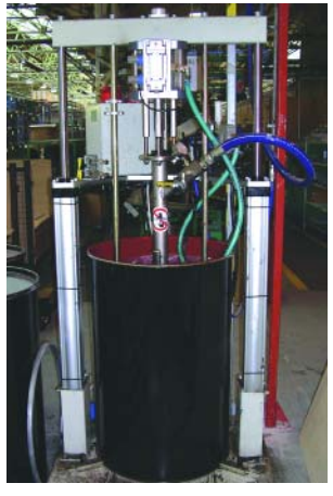
DOPAG P200 drum pump

Amongst the products produced by Merloni UK in the former GDA factory in Blythe Bridge, are both gas and electric cooker hobs, which range in size from 50 cm in width right up to 120 cm