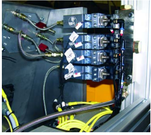
DOPAG metering valve bank

Now, the Birmingham based Company enjoys successful relationships with some of the leading suppliers to the automotive industry,