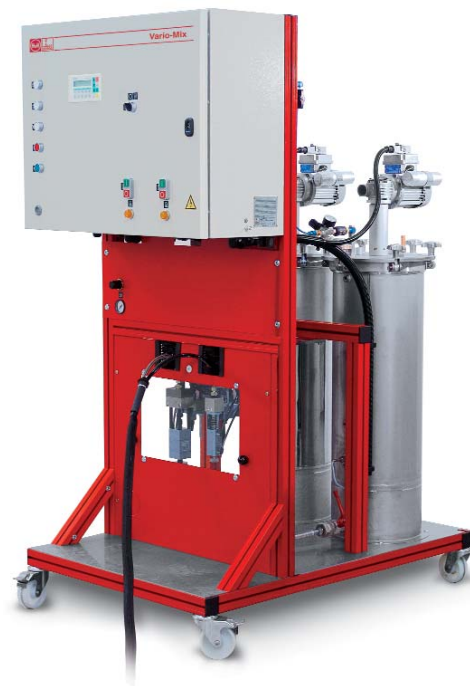
System concept DOPAG Metering Technology